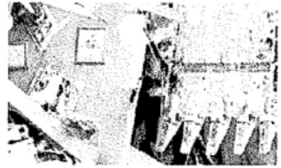
The teeth of an excavator shovel moves in on a family photograph still hanging on the wall of a home being demolished in New Orleans' Lower Ninth Ward.

Judge Lemelle told the San Francisco Bay View, "I can't legally discuss a case that is in litigation. I did rule, however, that my decision did not preclude anyone from challenging this decision or taking other actions."