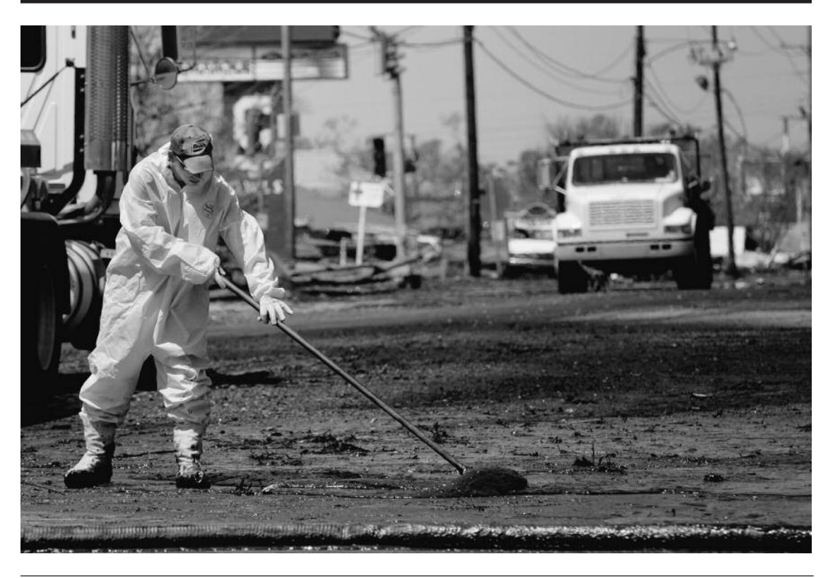
Note: A cleanup worker cleans up crude oil spilled from a local refinery in the wake of Hurricane Katrina. The toxic spill was inundating an estimated 1,500 to 2,000 homes.

Similar patterns were revealed by Hurricane Katrina. Ninety-eight percent of the residents of the Lower Ninth Ward, the lowest-lying area of New Orleans that was most vulnerable to flooding, were African Americans (versus 67 percent in the city as a whole and 37 percent in the entire metropolitan area).<sup>23</sup> As the hurricane drew near, many of the poor were unable to flee because they lacked private transportation. And, in the aftermath of the storm, a second disaster that involves disparities in recovery and reconstruction processes has started to unfold.